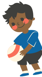
Be a team-player