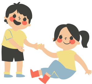
Be kind to others