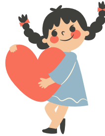
Love and respect others