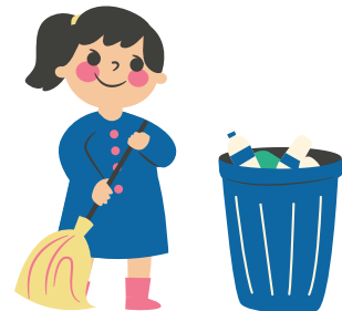
Keep room tidy